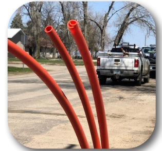
Wilmot's Fiber Build-out 2021

In 2021, Wilmot and Summit exchanges and the start of the Big Stone Lake would be the next projects in RC's fiber deployment. Wilmot and Summit businesses and residents heard the difference fiber optic and new Wi-Fi 6 equipment (now Wi-Fi 7- call for details) had made in neighboring communities and were excited and very anxious to get it!